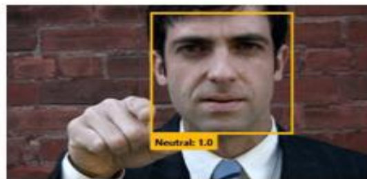
Fig. 4: Detecting Emotion via Azure

This API has been provided as a part of Microsoft Azure Cloud Services. This API recognizes human emotions in images and videos. This API recognizes human expressions in an image and returns a face identification boundary box. It detects happiness, sadness, surprise, anger, fear, contempt, and disgust. It returns emotions of a number of faces in a video over a period of time. The Emotion API uses JSON for data exchange and API keys for authentication.